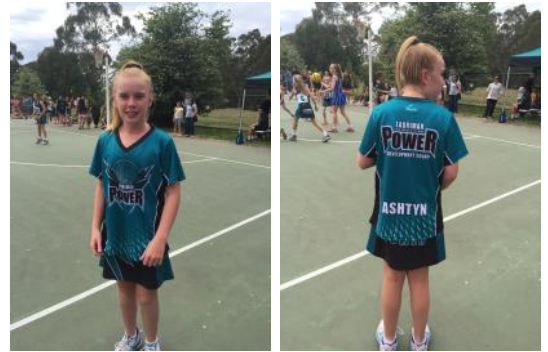
Tournament / Dev Squad (Teal) - $35