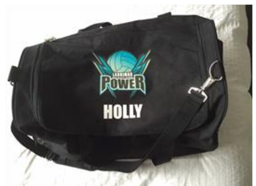
Club Bag with Name Printed - $40

We are also working on setting up a Buy Swap Sell Facebook site to help people buy and sell 2nd hand uniforms...stay tuned.