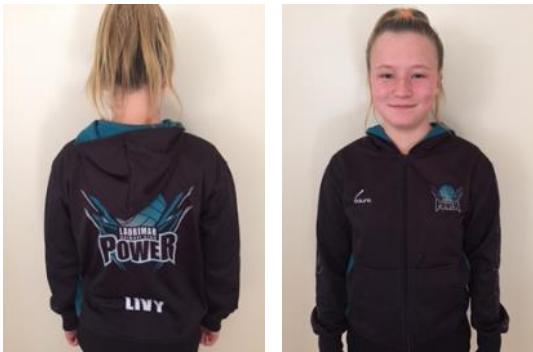
Club Jacket - $60