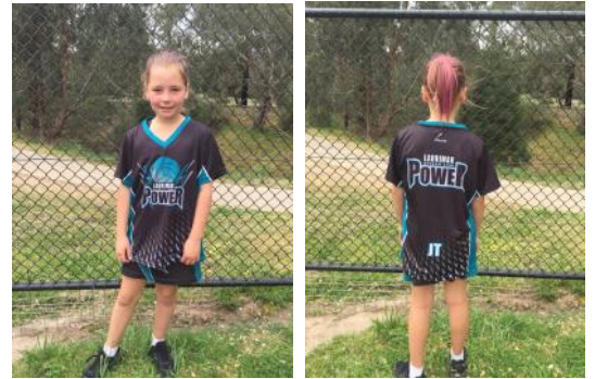
Club Training Top (Black) - $35